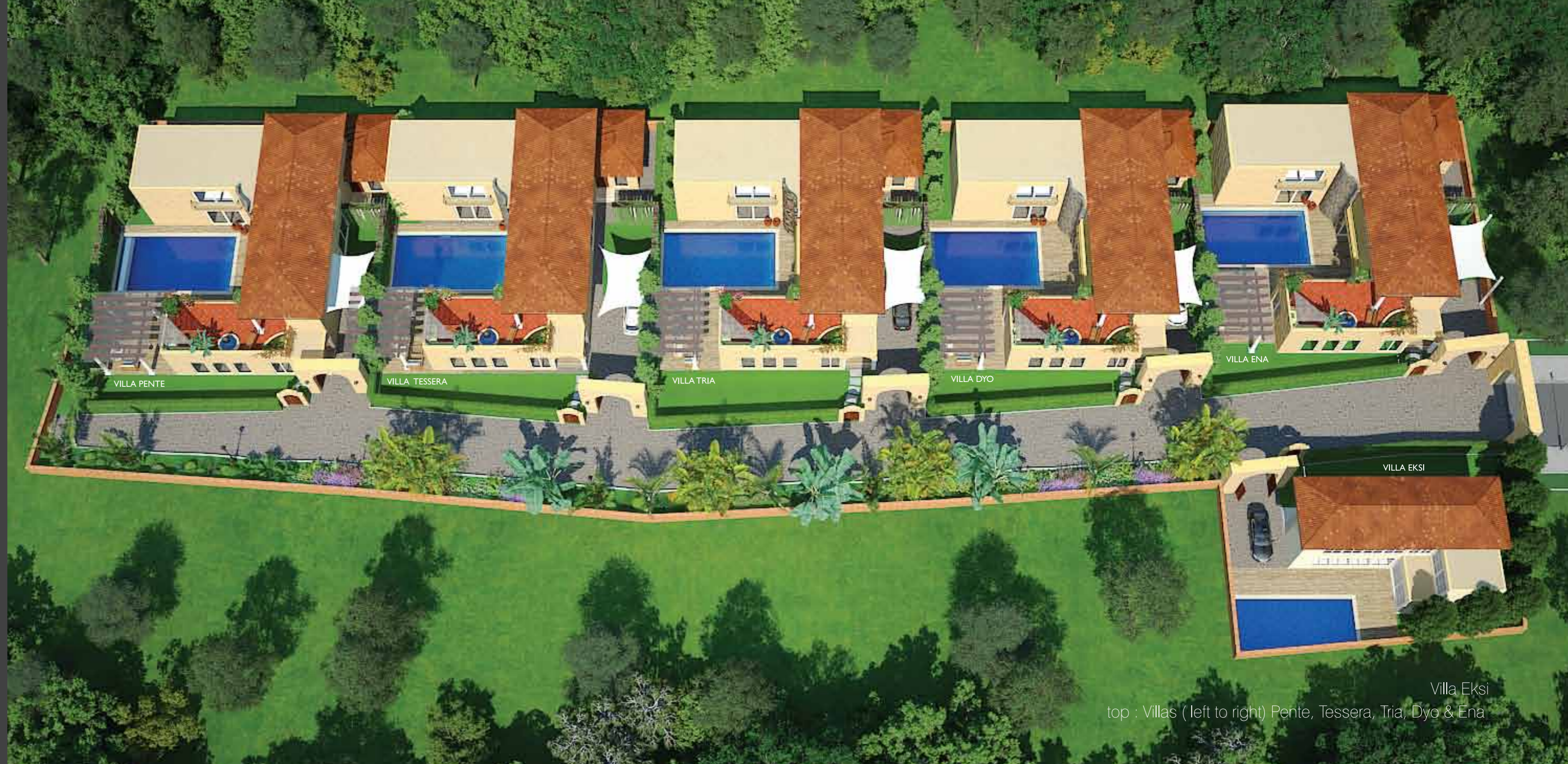
Villa Eksi top : Villas ( left to right) Pente, Tessera, Tria, Dyo & Ena