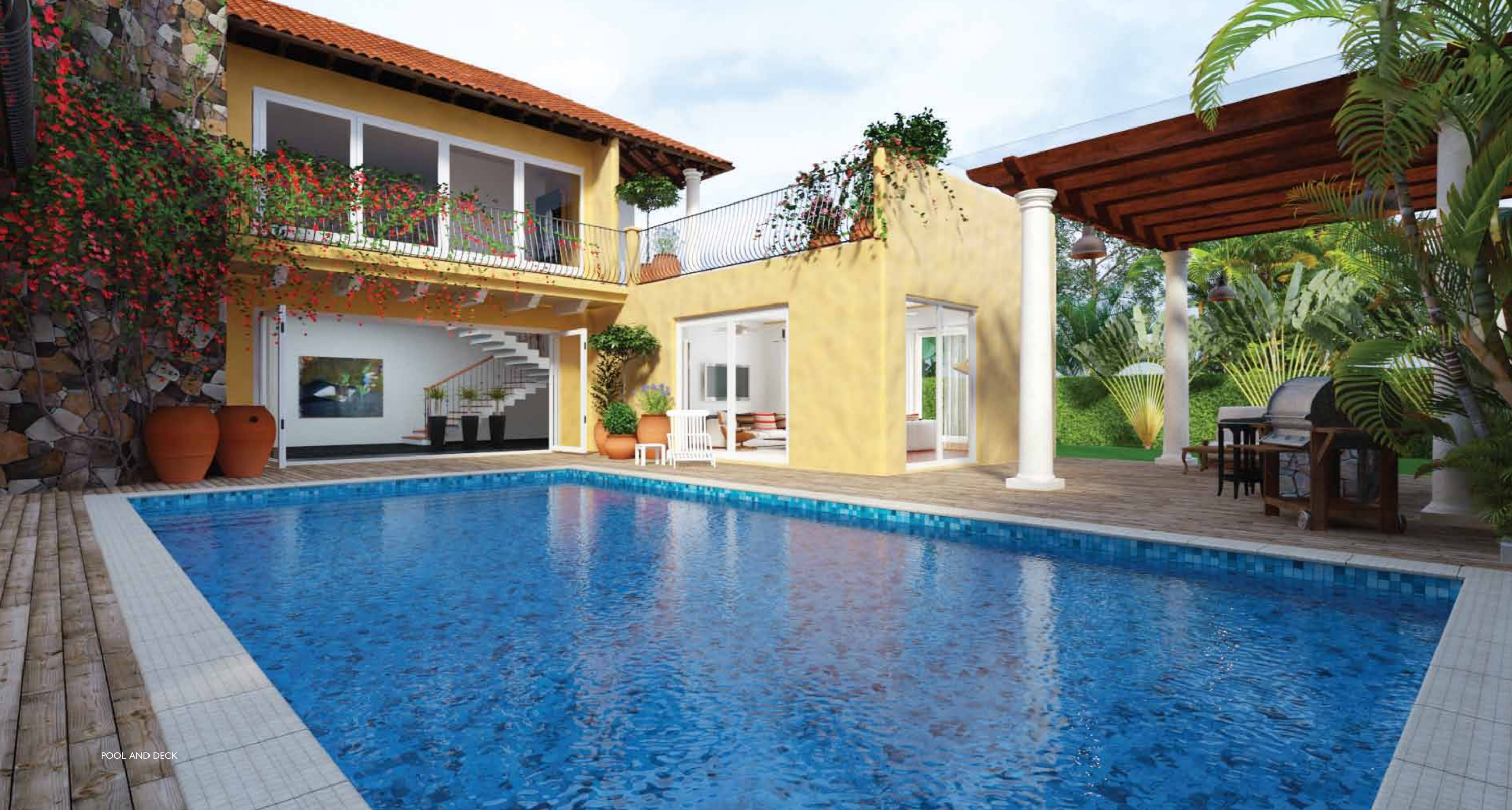
POOL AND DECK